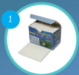
SOFT ROUND CHALK STW100, white, box of 100