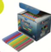
ROUND COATED DUSTLESS CHALK EXC100C, Assorted 10 colors ,box of 100