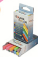
ROUND COATED DUSTLESS CHALK EXC10CH, Assorted 10 colors ,box of 10 with hang