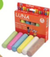
ROUND SIDE WALK CHALK SW5C, assorted color, Cardboard box of 6