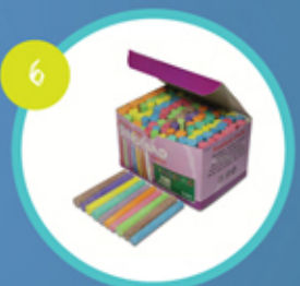
SOFT ROUND CHALK TAC100, Assorted colors, box of 100