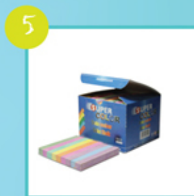
SOFT SQUARE CHALK SQW30P , Assorted 10 colors ,Tub of 30