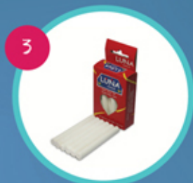
SOFT ROUND CHALK STW10, white, box of 10