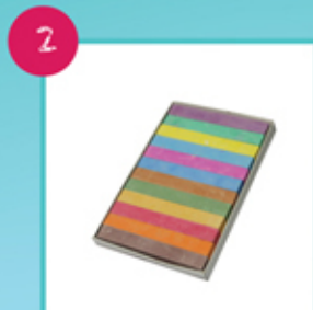
SOFT SQUARE CHALK SQC12 , Assorted 12 colors ,box of 12