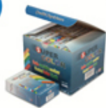
ROUND COATED DUSTLESS CHALK EXC10*10C, Assorted 10 colors ,10 boxes of 10 in box