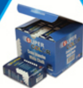
TRIANGULAR DUSTLESS CHALK EXW10*10R, white ,10 boxes of 10 in box