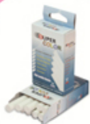
ROUND COATED DUSTLESS CHALK EXW10CH, white ,box of 10 with hang