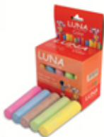
ROUND SIDE WALK CHALK SW15C, assorted color, Cardboard box of 15