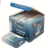
ROUND COATED DUSTLESS CHALK EXW10*10C, white ,10 boxes of 10 in box