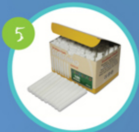
SOFT ROUND CHALK TAW100, white, box of 100