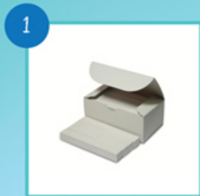
SOFT SQUARE CHALK SQW12 , white ,box of 12