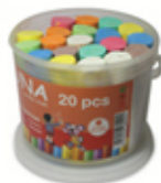
ROUND SIDE WALK CHALK SW20P, assorted color, Plastic tub 20