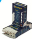
TRIANGULAR DUSTLESS CHALK EXW10R, white ,box of 10