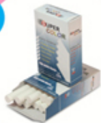
ROUND COATED DUSTLESS CHALK EXW10C, white ,box of 10