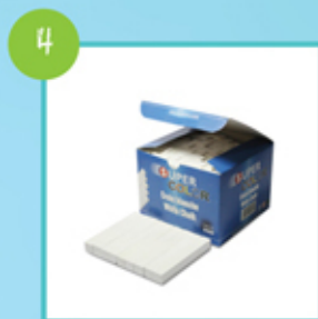
SOFT SQUARE CHALK SQW72 ,white ,box of 72