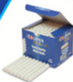
TRIANGULAR DUSTLESS CHALK EXW100R, white ,box of 100