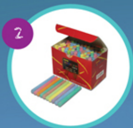
SOFT ROUND CHALK STC100, Assorted colors, box of 100