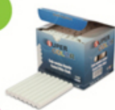
ROUND COATED DUSTLESS CHALK EXW100C, white ,box of 100