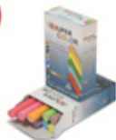
ROUND COATED DUSTLESS CHALK EXC10C, Assorted 10 colors ,box of 10