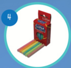
SOFT ROUND CHALK STC10, Assorted colors, box of 10